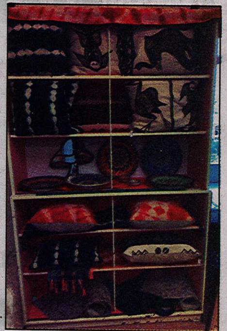
The store is full of holiday gift ideas from ornaments to vintage records.