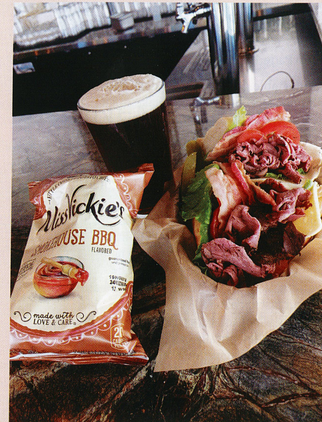
Bacon and Green Chile Roast Beef Sandwich is just one of the food items on the menu at the Boese Bros. restaurant and brewery in Los Alamos.

When they opened the Los Alamos location they paid attention to the aesthetic details before opening. The brewery has a light industrial look that is still