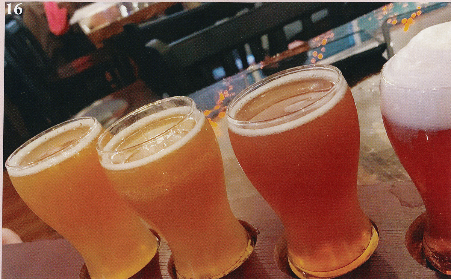
A flight of ciders at the Boese Bros. Brewery in Los Alamos.